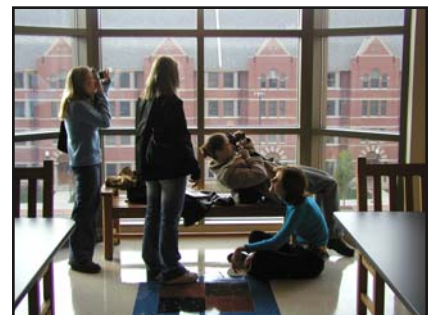
The beauty of the GVSU campus was not lost on the many camera-carrying students at the conference.