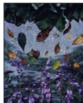
Evon Streetman © 2001