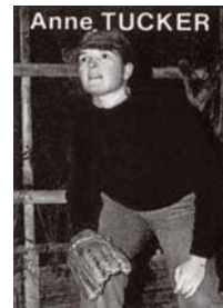
Mike Mandel © 1975 - Baseball Photographer Trading Cards