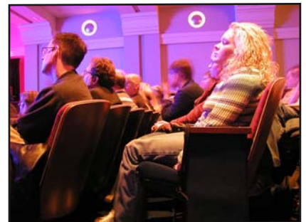
Tress spoke to a completely packed auditorium.