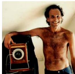
Max Kozloff © 1978