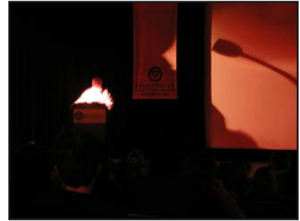
Arthur Tress and his shadow at the DeVos Center of GVSU in Grand Rapids, Michigan.