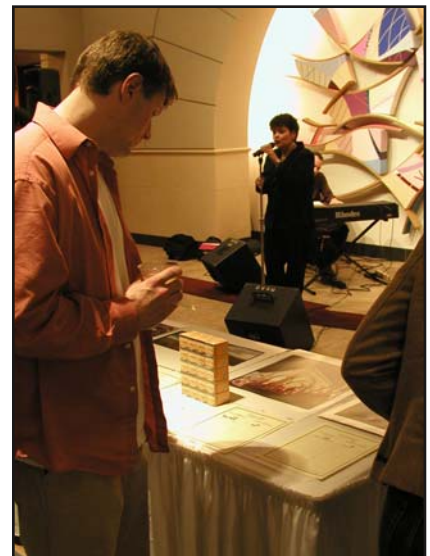
Refreshments, live entertainment and a great selection of goodies marked the silent auction.